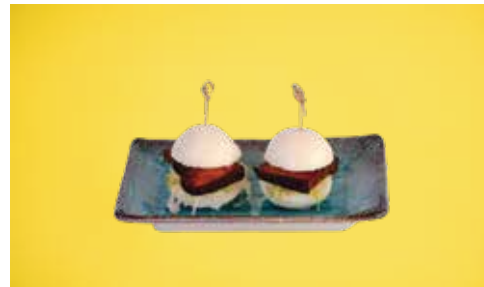
Pork Belly Sliders $12 *dinner only*

BOOST YOUR SOUP + Silken Tofu | Crispy Tofu | Bok Choy $3 + Chicken | Beef | Mushroom $4 + Flavour Bomb (ginger, garlic + lemongrass) $3 + Gluten Free Noodles $2