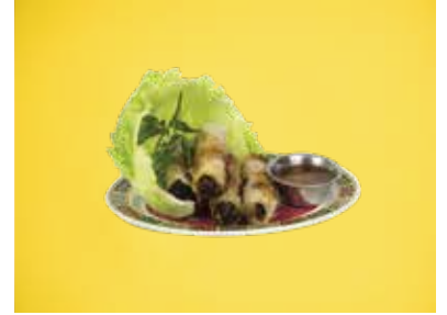
Hanoi Style Spring Rolls $14