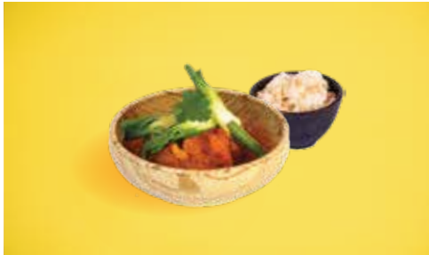
Northern Style Chicken Curry (gf) $22