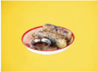
Chargrilled Chicken (gf*)(n*) $9