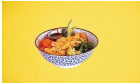
Tofu Vermicelli Salad (gf*, ve, n*) $16