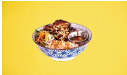
Vietnamese Chicken Rice (gf*, n*) $17