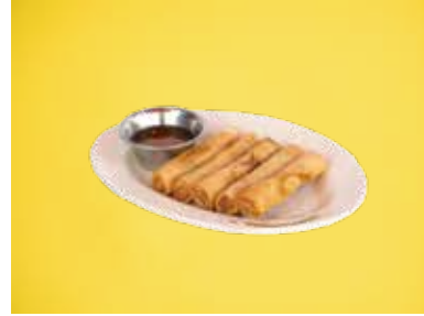
Prawn Spring Rolls $14