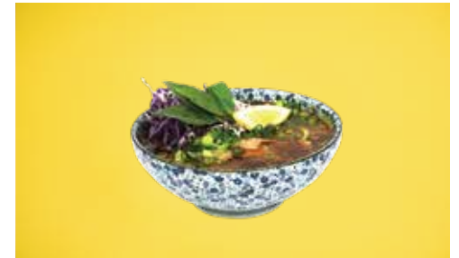
Spicy Beef Brisket Pho (gf*) $18