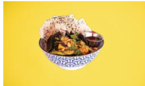
Crispy Spring Rolls Vermicelli Salad(ve, n*) $17