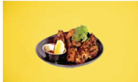
Grilled Chicken Ribs (gf) $16