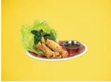
Sweet Potato Net Rolls (ve) $12