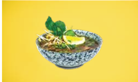
Tender Beef Pho (gf*) $16