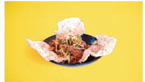
Rare Beef Salad (gf) $19