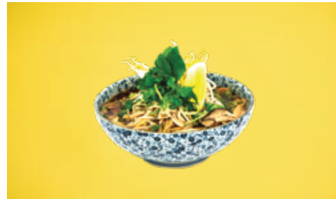
Mixed Mushroom Pho (gf*, ve) $16