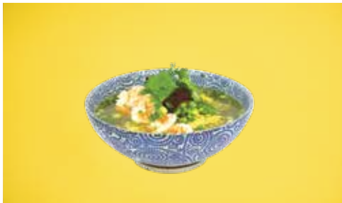
Xo Pho Egg Noodle w/ Crispy Pork + Prawn Pho $18

BOOST YOUR SOUP + Silken Tofu | Crispy Tofu | Bok Choy $3 + Chicken | Beef | Mushroom $4 + Flavour Bomb (ginger, garlic + lemongrass) $3 + Gluten Free Noodles $2