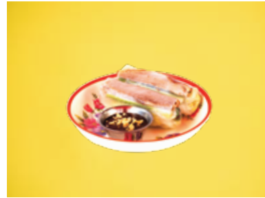
Peking Duck + Spring Onion (n) $10