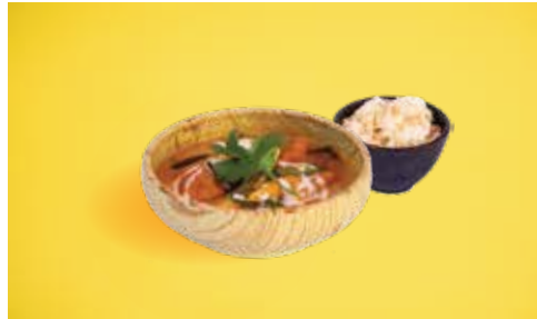
Pumpkin Yellow Curry w/ Eggplant (ve, gf*) $21