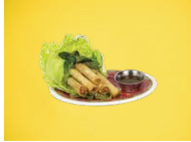
Veg Spring Rolls (ve) $13