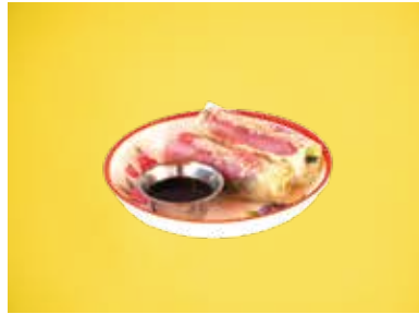
Yellowfin Tuna + Wasabi Mayo (gf*) $11