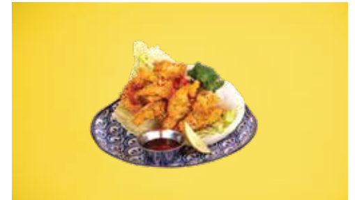
Lime + Pepper Squid $17