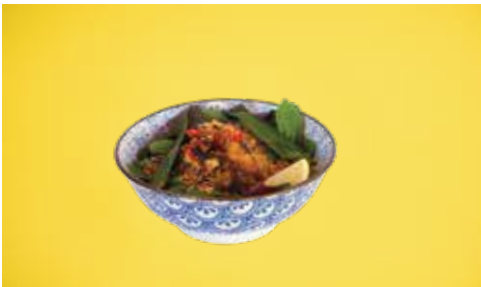
Grilled Fish Tumeric Vermicelli Salad (gf) $22