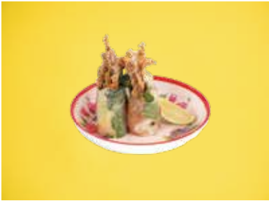
Chilli Softshell Crab $12