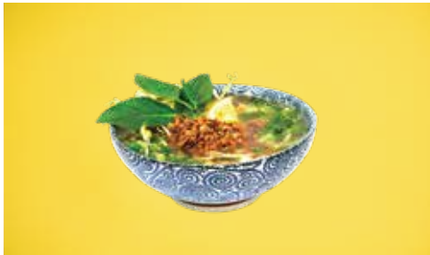
Poached Chicken Pho (gf*) $16