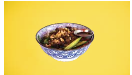
Lemongrass Beef Vermicelli Salad (n*) $19