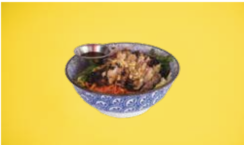
Chargrilled Chicken Vermicelli Salad (gf*, n*) $17